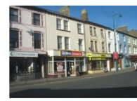
Small business security checklist