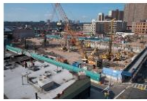
Building site security