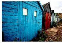
Beach hut security