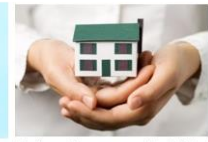
Extending or refurbishing